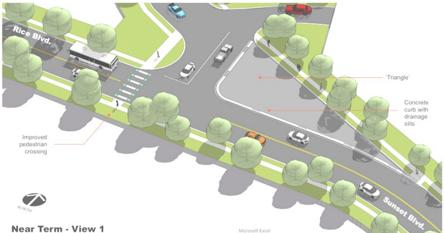
Near Term - View 1

I cannot thank stakeholders and those involved in this process, including our City departments, enough for their thoughtful input. Everyone worked together, and I have no doubt more efforts for the area are ahead in the future!